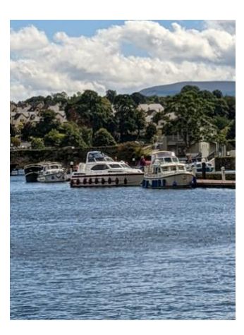
On Lough Derg approaching Killaloe