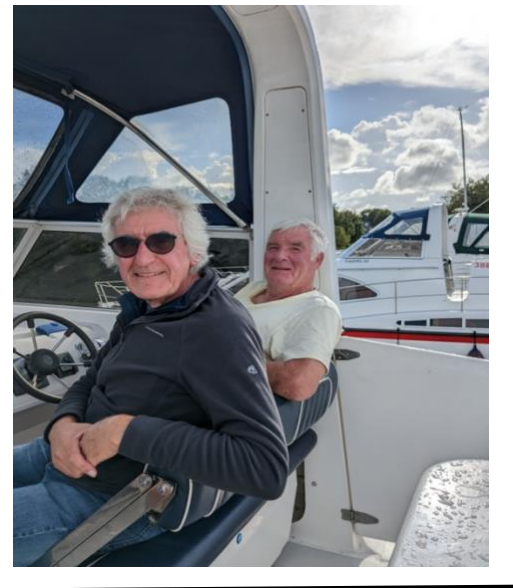
This was taken during our week boating on Lough Derg which was part of the River Shannon in Eire. Beautful part of the world worth visiting if you haven't been before.