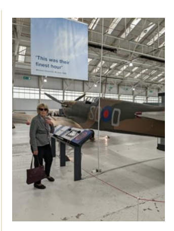
Maureen reading about the famous Spitfire

We shared bikes and we shared footballs Used our sweaters as the goal And when the bitter winter came We'd fill buckets up with coal Every single chimney Cast a plume into the sky As we huddled by the fire With a meat and tatty pie Bath night was always Sunday And the tub we had to share A frozen dash from the bathroom With vosene suds in your hair Scratch your name on the frosty pane Before the curtains shut Tucked under a heap of blankets No choice but to stay put We never took a holiday Certainly not abroad A day out to skeqgy Was all we could afford We'd paddle in the Sea And sit down in the foam Ride a donkey up the beach And wish we could take it home