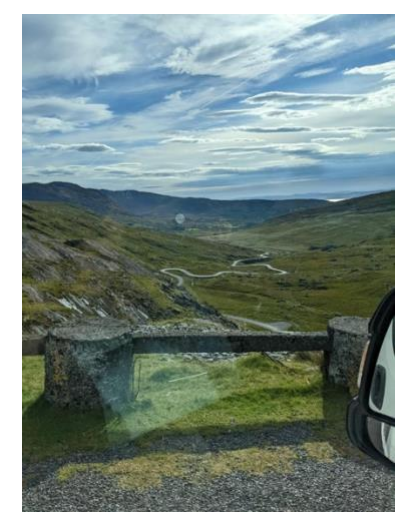
Crossing the Cork & Kerry Mountains